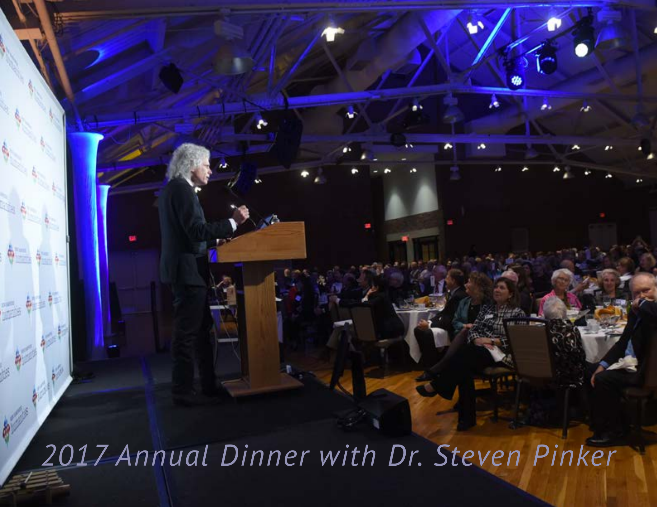
2017 Annual Dinner with Dr. Steven Pinker